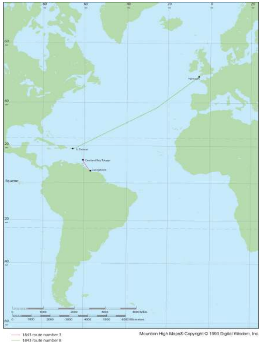
Figure 2: The RMSPC's May 1843 route scheme, showing routes 3 and 8.

Networked approaches have enabled “new imperial” scholars to examine the multiple projects and sites of empire, bringing metropolitan and colonial spaces into a single frame of analysis (Cooper & Stoler, 1997; Lambert & Lester, 2006, pp. 8–9; Wilson, 2004). While there is a wealth of recent work examining imperial trajectories and social as well as business networks (see, for example, Laidlaw, 2005; Ward, 2009), “it remains to develop a more detailed and materially ‘grounded’ understanding of the intricately fabricated imperial networks that actually linked colony and metropole together” (Lester, 2002, p. 30). In this paper, the RMSPC is considered as such a materialized network, specifically one that provided transportation and communication links in British imperial and extra-imperial spaces. Transport infrastructures such as steamship services were “complex fabrication[s]”, characterized by improvisation and relationality, and always in process (Ballantyne, 2002, p. 15). Furthermore, steamship networks, like imperial webs, comprised both vertical relations and crucial “horizontal linkages between colonies” (ibid.).