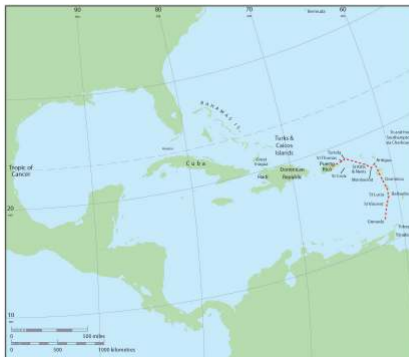
Figure 3: The RMSPC's 1843 Northern Islands route.