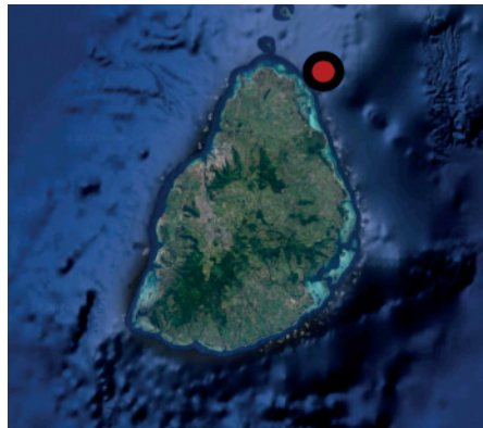
Figure 2: Main island of Mauritius, marking Ilot Bernaches.

The area of study, which is Ilot Bernaches, is less than 2 acres in size and is illustrated by Figure 2. The islet is made up primarily of coralline sand with some coral outcrops and is surrounded by mangrove trees and rocks. Ilot Bernaches comprises considerable endemic and exotic resources that appeal to visitors. For instance, rare birds (Tourterelle, Perdrix, and Pic Pic), butterflies, rabbit and pine trees, palm trees, mangrove, berry trees, flowers, and tropical fruit trees represent the flora and fauna of the islet. The islet is so small that it takes around 30 minutes to walk around it. There are some beautiful stretches of sandy beaches, and the islet is often visited by tourists and locals. The rest of the islet's beaches are made up of rocks and boulders. The islet is accessible from two main embarkation points of Mauritius (Bain de Rosnay and Goodlands) and from the Poudre D'or public beach, and it takes around 35 minutes to reach the islet. Ilot Bernaches is mainly popular for its beach and sea activities. Ordinary boats, catamarans, speedboats, and pleasure craft are the means of transport utilised to reach the islet.